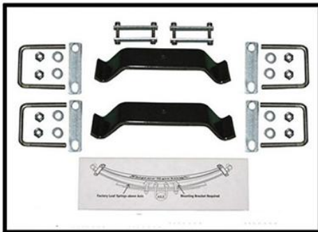
SuperSprings Mounting Kit # MTKT Installed →