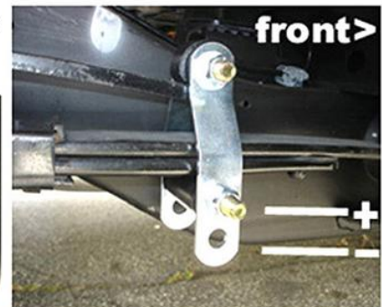
set spring pre-load & ride height

Refer to SuperSprings application guide for part selection www.supersprings.com [Tech line #866-898-0720] SuperSprings enhance load carrying capability, handling & towing. Never exceed vehicle manufacturer's GVWR rating.