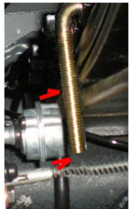
install hardware clear of factory sensor at axle rear