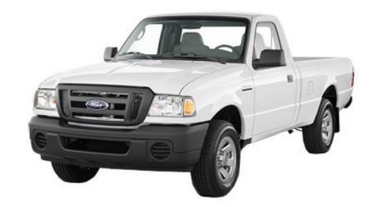
Mounting Kit included