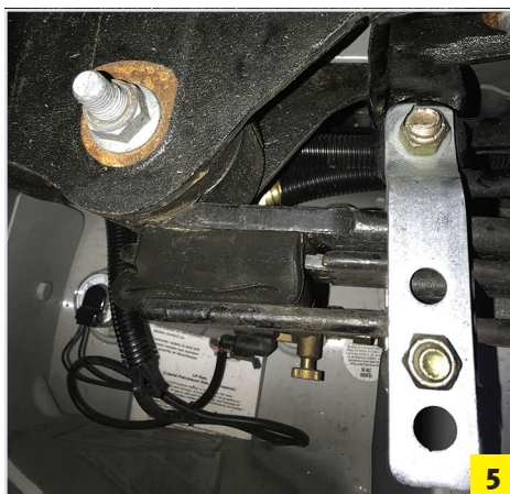
On vehicles with CAST steel leaf spring mounts: the middle hole of the SSA43 shackle MUST be used.