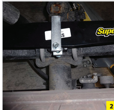
Looking down at the top of the SSA43