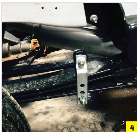
On vehicles with STAMPED steel leaf spring mounts: either the lower or middle hole of the SSA43 shackle may be used.