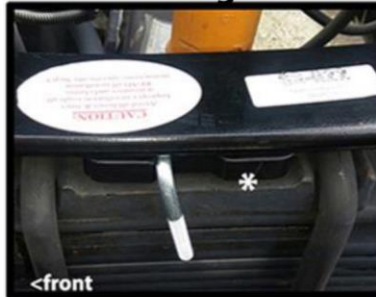
Place PSP-19 on top of spring plate flat side up facing, with groove toward the front