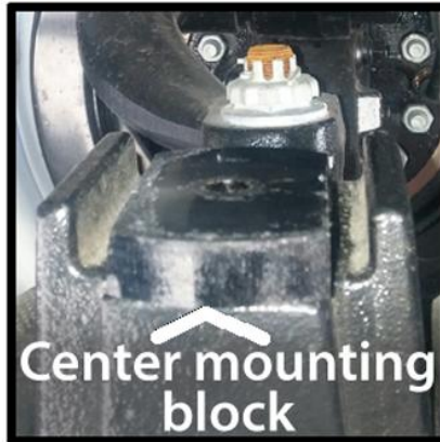
Center mounting block