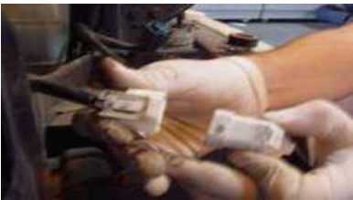
Unclip the headlight wire harness from the bulbs.