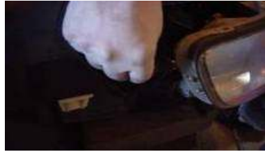
Twist off the turn signals in the headlight.