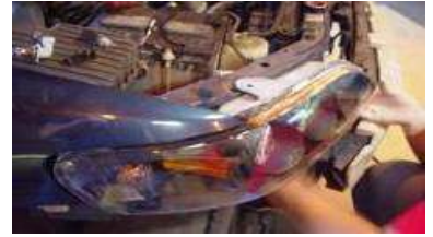
Install your new head light by reversing the steps.