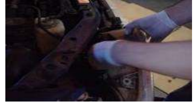
Twist off the headlight bulbs.