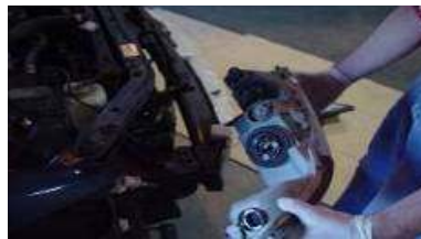
The headlight will now come right out.