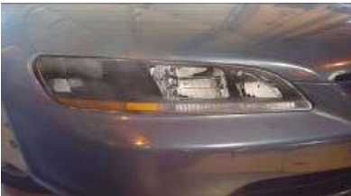
Test all functions of the light before operating on the highway.

AnzoUSA™ products are covered, by a limited one (1) year warranty, to be free of manufacturer's defects. However, certain AnzoUSA™ product categories have warranty policies which differ from this standard, please contact your representative for detailed category information. Damage due to improper installation or road hazards is not covered. Seller and manufacturers' only obligations shall be to replace the product proven to be defective. Neither seller nor manufacturer shall be liable for any injury, loss or damage, direct or consequential, arising out of the use of or the inability to use the product. Before using, user shall determine the suitability of the product for its intended use, and user assumes all risk and liability whatsoever in connection therewith.