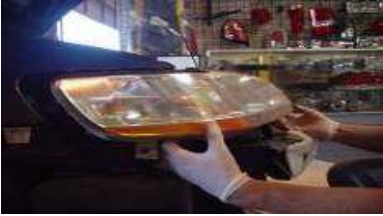
Remove the headlight from the frame.