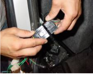
Step 13: Plug the new tail light wire harness in to the original wire harness.