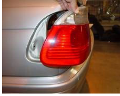
Step 11: Take the tail light off.