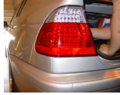
Step 12: Put the new Anzo light in and screw it on.