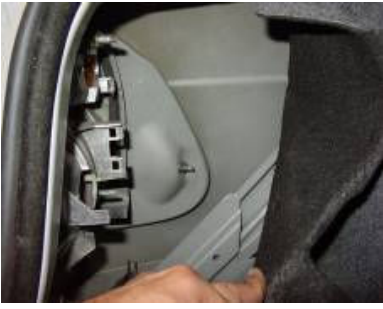
Step 10: Pull back the trunk lining to remove the last bolt.