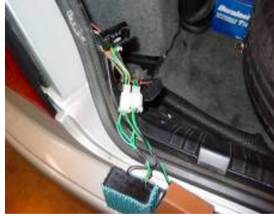
Step 14: Put the resistors into the bottom of the tail light housing.