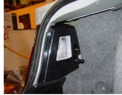
Step 15: Put the new cover for the light on.