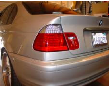
Step 16: Test all functions and make sure it's working properly before driving.

AnzoUSA™ products are covered, by a limited one (1) year warranty, to be free of manufacturer's defects. However, certain AnzoUSA™ product categories have warranty policies which differ from this standard, please contact your representative for detailed category information. Damage due to improper installation or road hazards is not covered. Seller and manufacturers' only obligations shall be to replace the product proven to be defective. Neither seller nor manufacturer shall be liable for any injury, loss or damage, direct or consequential, arising out of the use of or the inability to use the product. Before using, user shall determine the suitability of the product for its intended use, and user assumes all risk and liability whatsoever in connection therewith.