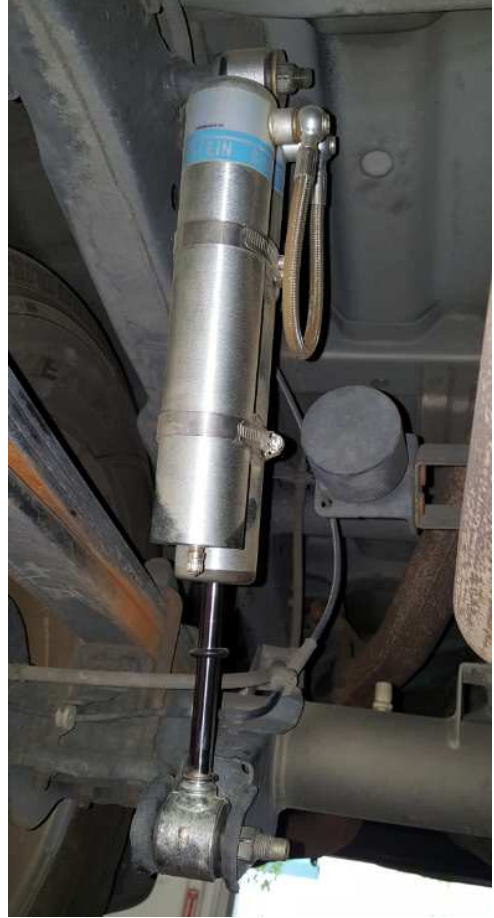
Figure 4. right rear crew cab / king cab