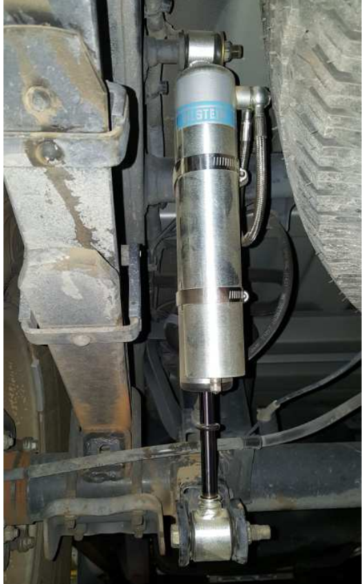
Figure 1. left rear, crew cab