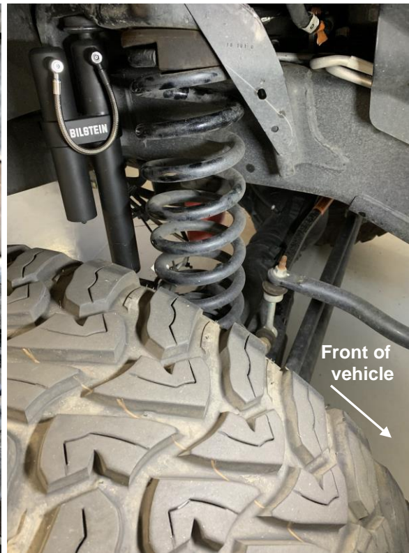
Figure 2. Passenger Side