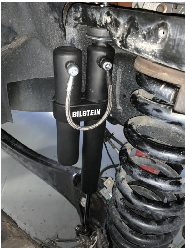
Figure 1. Passenger Side