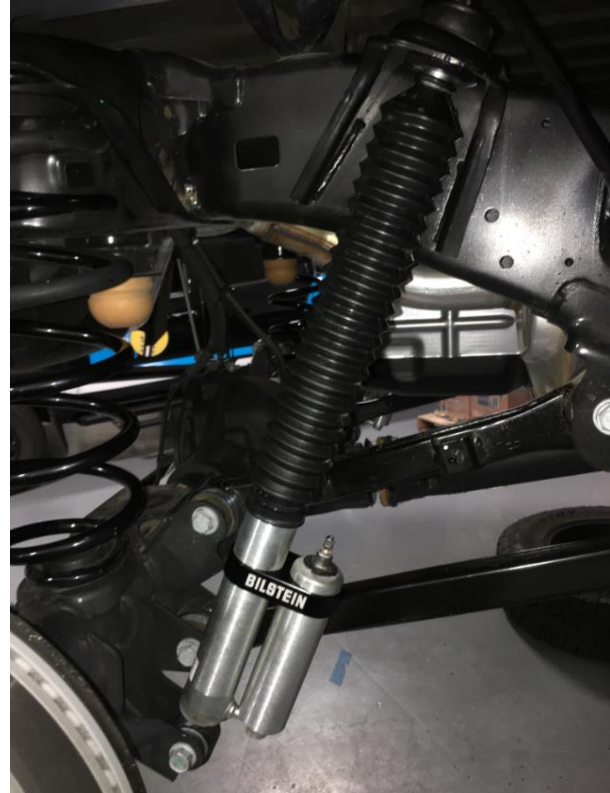
Figure 3 – RIGHT REAR

Note: The shocks differ slightly in appearance from the supplied components.