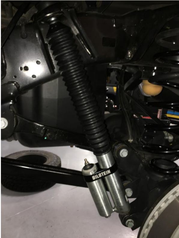
Figure 2 – LEFT REAR