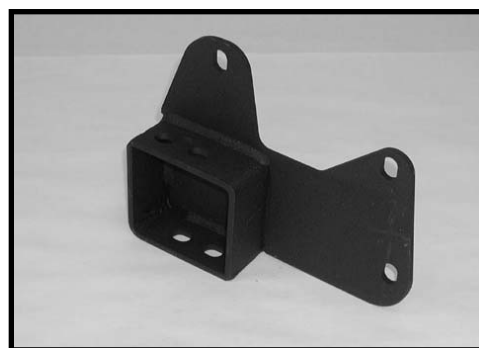
F404 / Qty. 1 Passenger side radius arm relocation bracket