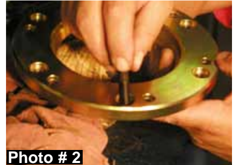
Photo # 2